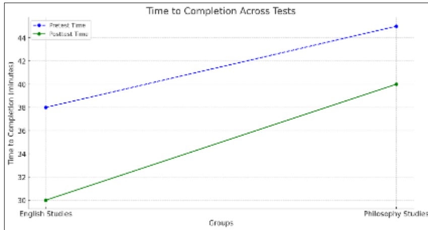
Figure 2 Completion time across tests for English and philosophy students

The Line Graph analysis of time-to-completion illustrates a reduction in time for both groups, with English Studies students completing the tasks faster in both tests.